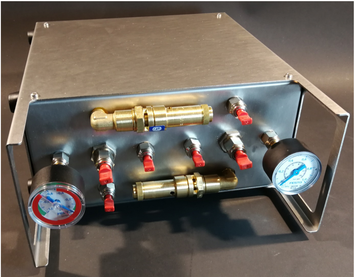
Photo show vacuum connected to the left channel and pressurised air to the right channel.

Gauges are OD 40 mm with a 6 mm tube glued into the rear metal part. Allow for simple connection to the 6 mm on-touch fittings. One gauge for +1,2 Bar and one gauge for -1 Bar.